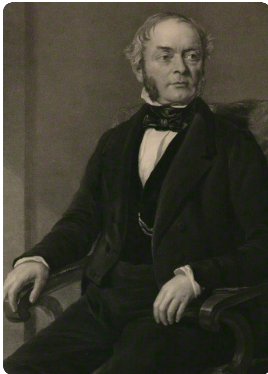
Samuel Wilderspin (1791–1866)

Samuel Wilderspin was a teacher who is known as the founder of infant education. He had enjoyed learning at home and looked forward to going to school. When he started school he didn't like the strict teachers or the boring lessons. He believed that children should enjoy school and be happy. He invented the school playground so children could play outside.