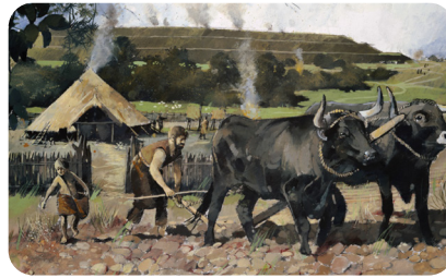
Artist's impression of Iron Age arable farming