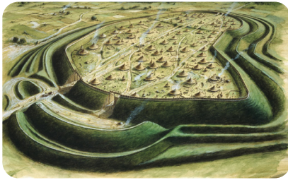
Artist's impression of an Iron Age hillfort