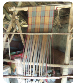
Colourful cloth weaving