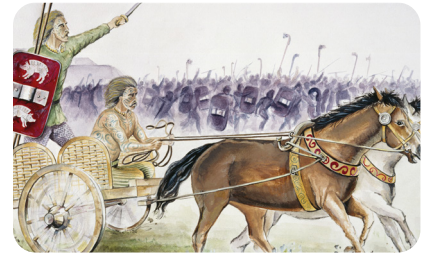
Artist's impression of Celtic warriors